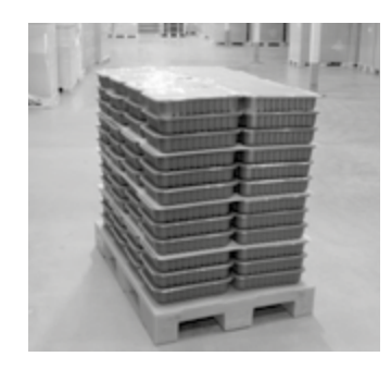
Full trays packed directly on pallet